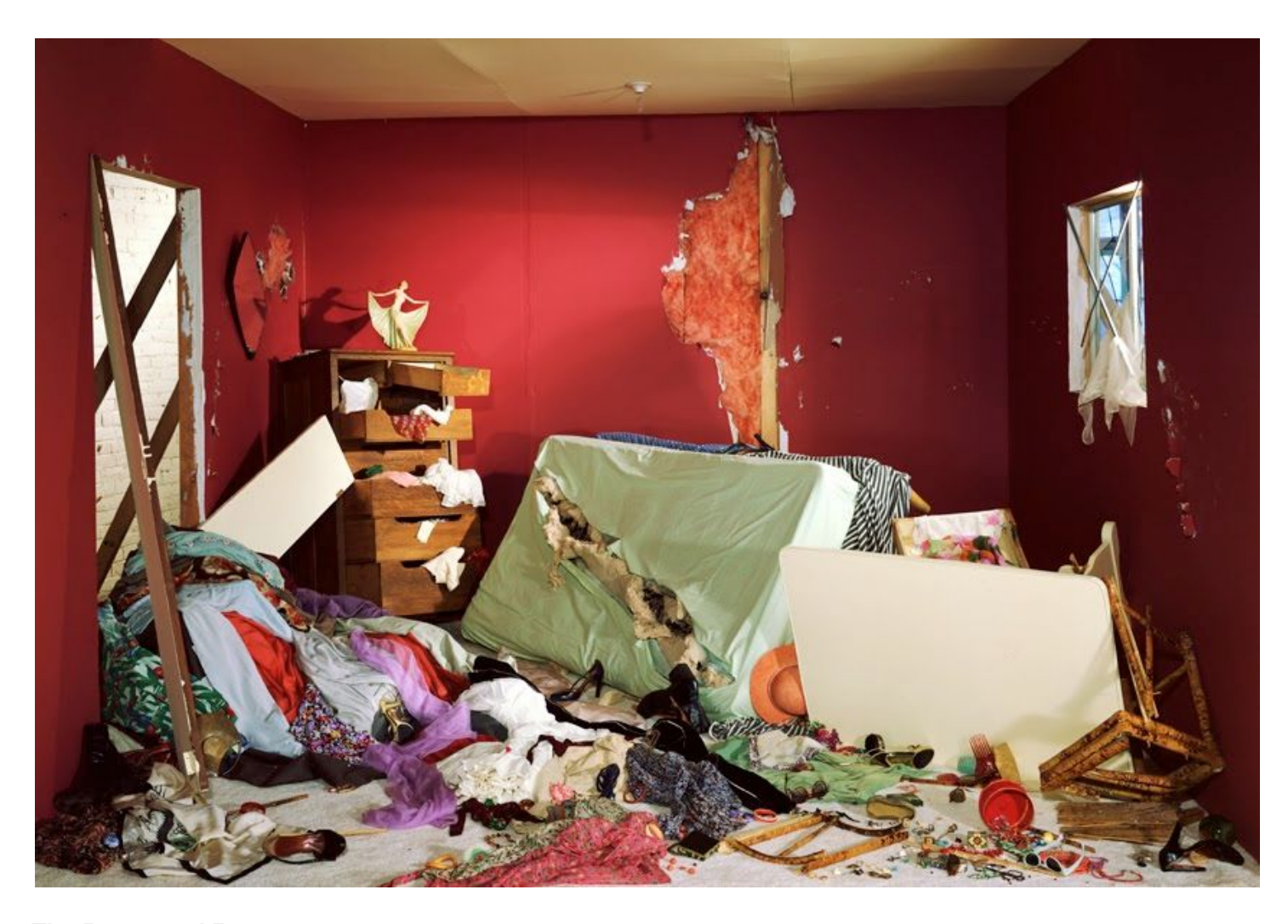
The Destroyed Room